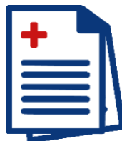
Physical examination record and blood test reports (original, if available)