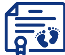
Passport, visa marriage, certificate, and birth certificates of your family members (if any)