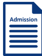
Admission Letter form Wenzhou University (original copy)