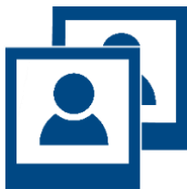
2-inch full-faced photos with white background (at least 2 copies)