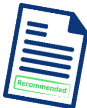
Transfer letter ( if necessary )