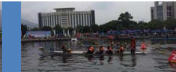
Dragon Boat Festival

is one of the most important sacrificial days. It is and it the day when people sweep tombs and offer sacrifices to ancestors. Tomb Sweeping day is normally in early April when Spring returns and the world is full of vigor. Therefore, people also go out to enjoy the beautiful scenery on Tomb Sweeping day.