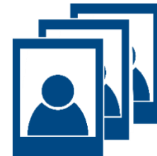
Three passport photos

Please keep in mind that no one can register on your behalf.