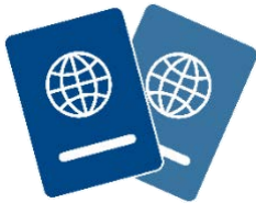
Valid passport and visa

Below is the checklist of important documents that you must carry with you.