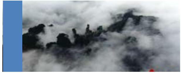
Tomb Sweeping day

is the first day of the Chinese lunar new year. It is the most important, most featured and grandest traditional festival, and it has a history of over 4,000 years. To celebrate, people eat dumplings, set off fireworks and pay visits to relatives and friends during the Spring Festival. Due to the difference between Chinese lunar year and the common calendar year, Spring Festival normally takes place in January or February.