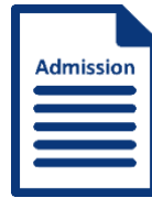
Admissions Notification (original copy)