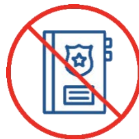
No criminal report (if necessary)